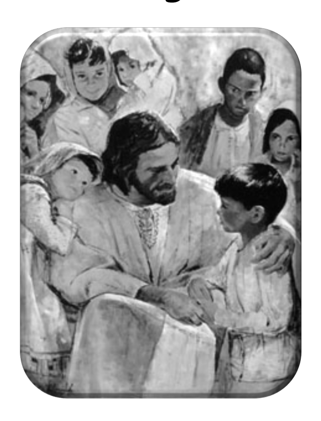
English Language Curriculum for Children